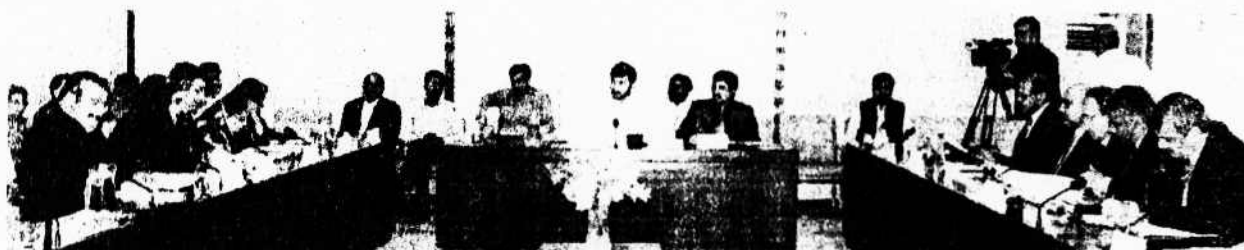
SENATOR HILAL UR REHMAN, CHAIRMAN SENATE STANDING COMMITTEE ON OVERSEAS PAKISTANIS AND HUMAN RESOURCE DEVELOPMENT PRESIDING OVER A MEETING OF THE COMMITTEE AT PARLIAMENT HOUSE ISLAMABAD ON OCTOBER 1, 2019.