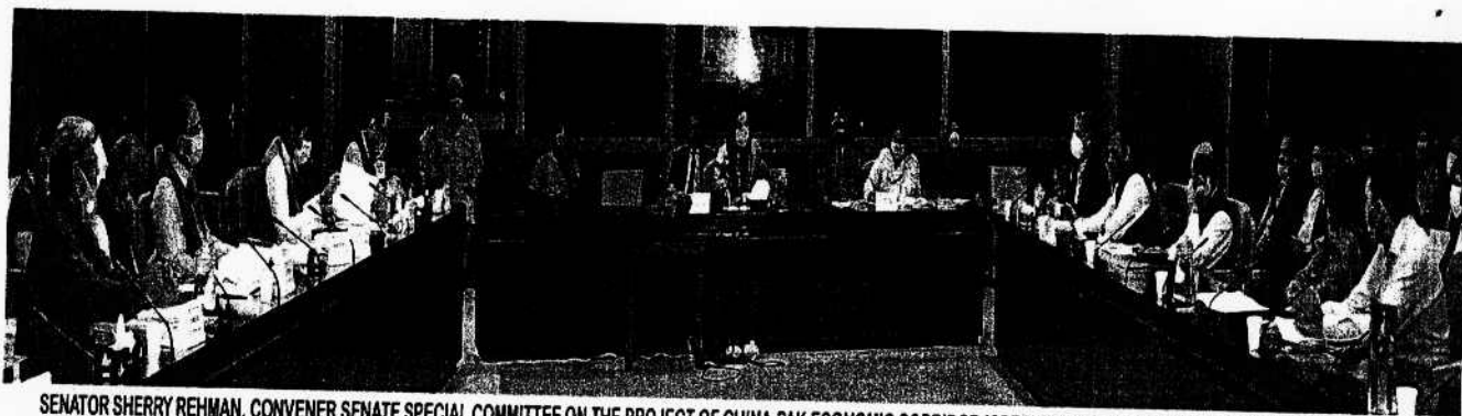
SENATOR SHERRY REHMAN, CONVENER SENATE SPECIAL COMMITTEE ON THE PROJECT OF CHINA-PAK ECONOMIC CORRIDOR (CPEC) PRESIDING OVER A MEETING OF THE COMMITTEE AT PARLIAMENT HOUSE ISLAMABAD ON JULY 20, 2020.