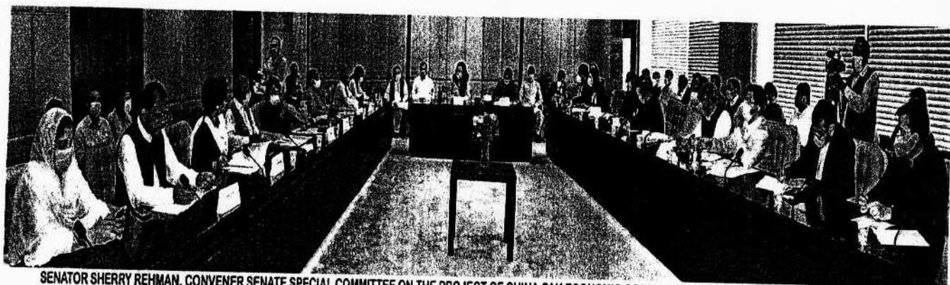
SENATOR SHERRY REHMAN, CONVENER SENATE SPECIAL COMMITTEE ON THE PROJECT OF CHINA-PAK ECONOMIC CORRIDOR (CPEC) PRESIDING OVER A MEETING OF THE COMMITTEE AT PARLIAMENT HOUSE ISLAMABAD ON OCTOBER 02, 2020.